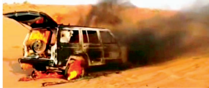
The four-wheel-drive vehicle in flames at Azbah, Umm Al Quwain.

vehicles caught fire in different areas of the northern emirate recently. "These included different types of vehicles — four-wheel-drive vehicles, a truck, trailers, and cars," said a civil defence official.