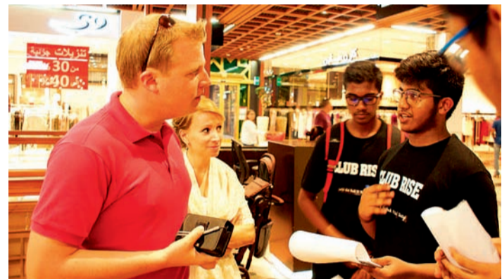
Members of Club Rise Abu Dhabi meet mall visitors to raise awareness about protecting the environment.