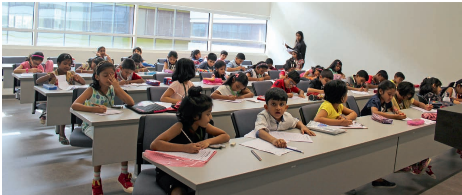
Students during the 45-minute grand finale examination. The exam was organised to keep students engaged and interested in math.